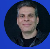
Alon Shepon National Champion of Israel